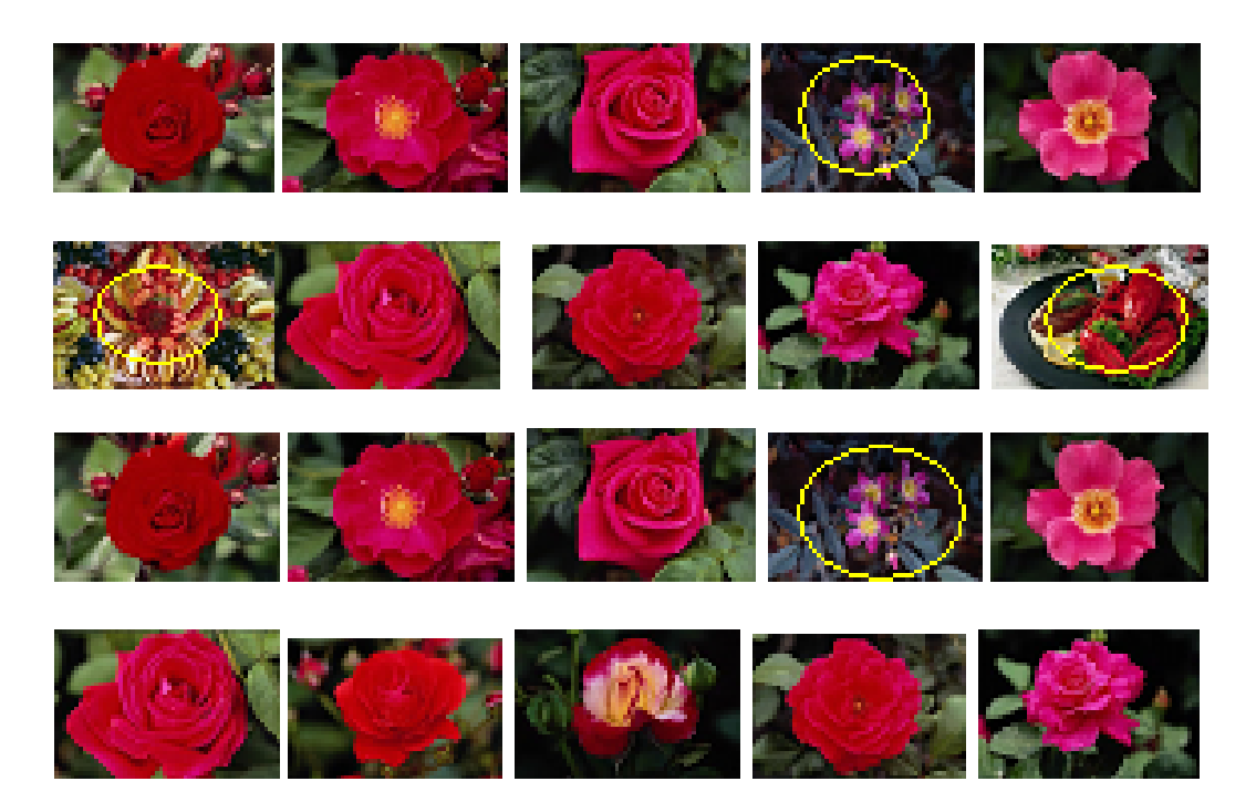
(a) Before - Ranking (Yahoo Image Search results)

Sekhar et al., Orient. J. Comp. Sci. & Technol., Vol. 1(2), 155-160 (2008)