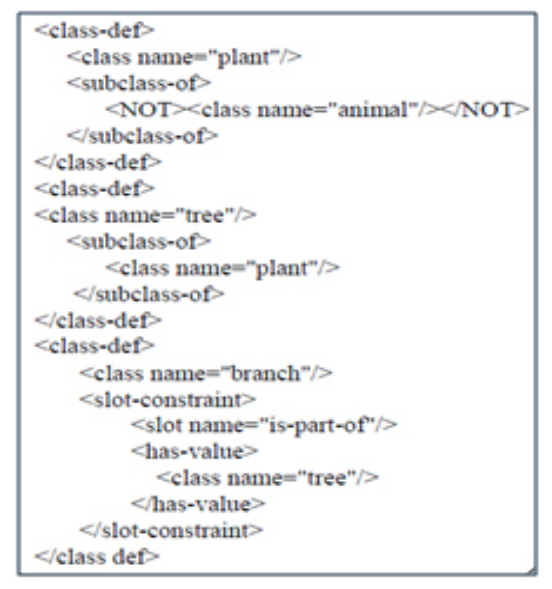
Fig. 1: XML data mode based tree

Semantic Web is extending syntactic interoperability to semantic interoperability by providing a source of shared, precisely defined terms through one key which is ontology. [8]