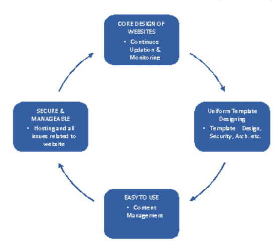
Fig. 2: Basic architecture for designing and development of educational websites

The basic theme and purpose of any university